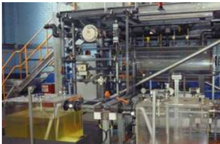
Oil & Gas Process Training Facilities

*Other courses, dates and locations are available, please contact us for details