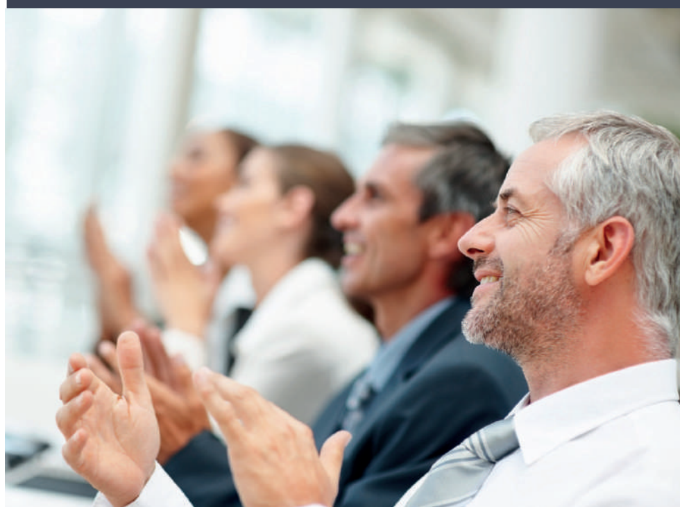
Cross Section of Business Executives

*Other dates and locations available, Please contact us for details