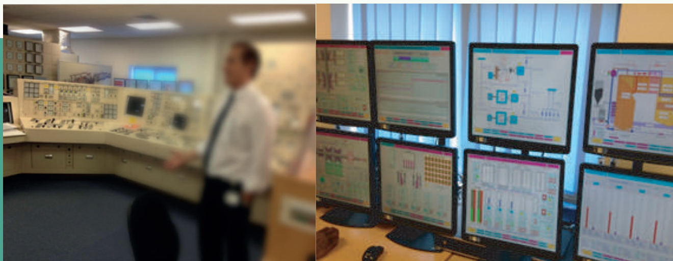
Fig. 1: Layout of Power Plant Monitoring & Control Training Facility

Summit School of Leadership and Management (UK) Ltd specialises in the delivery of technical training and consultancy services globally. Our range of services includes: