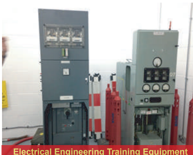
Electrical Engineering Training Equipment