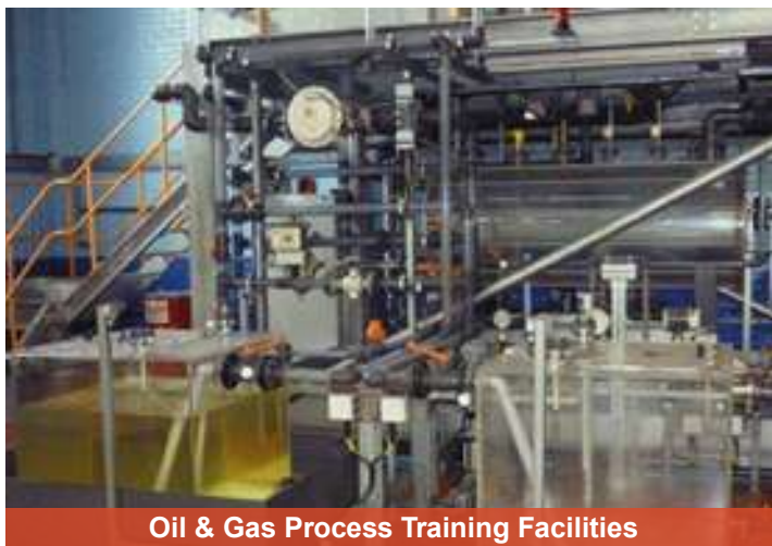
Oil & Gas Process Training Facilities

*Other training dates available; please contact us for more details