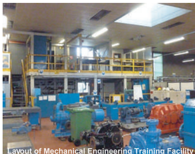
Layout of Mechanical Engineering Training Facility

*Other dates and location are available, please contact us for details